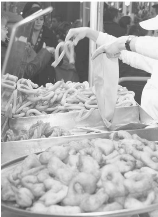
Close up view of a woman selling churros on the street in Valencia, during the Fallas Festival.

Churros are fritters made of flour, water, and salt, fried in oil and served piping hot with sugar sprinkled on top. You can find them in the streets of North Africa as well as in Central and South America. In Spain, churros are sold in paper cones mainly in the churrerías , purpose-built shops often located close to local markets. Churros and a variation called porras are bought by the public in the morning to eat in the street or take home for breakfast. Churros are also fried on festive days